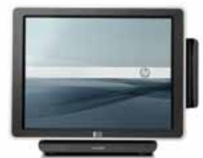
Shown with optional bi-directional MSR

Options sold separately and may not be available in all regions.