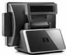
Shown with optional 2-line Customer Display Kit