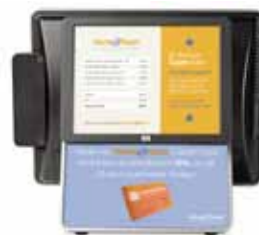
Shown with optional 10-inch LCD Customer Display