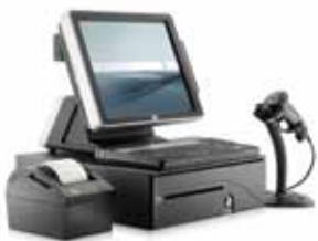
Shown with optional Receipt Printer, Cash Drawer and Laser Barcode Scanner